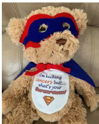
Actual picture of the bears to be donated

Donate blood at one of our centers from Aug. 1 st – Aug 13 th and give our Group Number: 214003 and help us reach our goal of 125 . The grand finale will be at Tipitinas on Aug. 14 th from 11am- 5pm sponsored by the Krewe of Rolling Elvi .